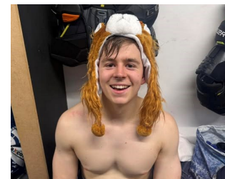
Corner was voted 'Lion of the Match'.