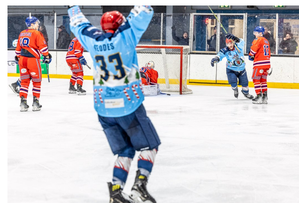
Celebration time