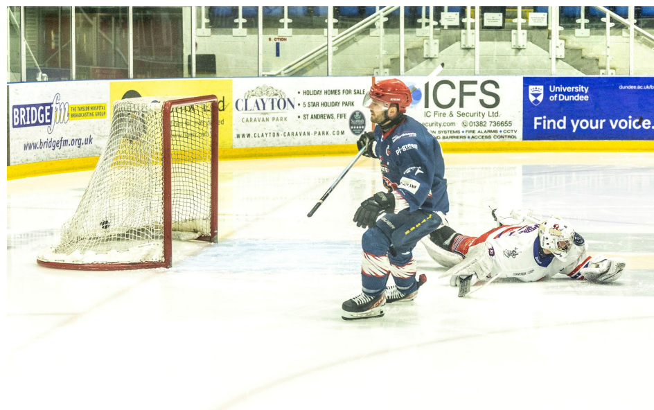
One of the few crumbs of comfort at Dundee . Pic by Ian Coyle